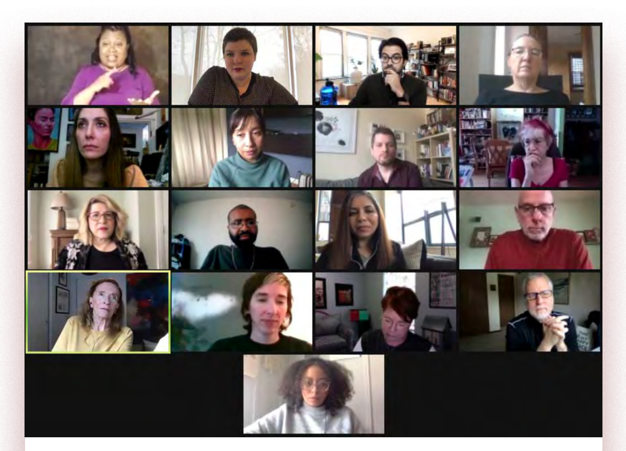
Image: Seventeen faces of alumni and staff from the Fellowship program appear in a screenshot from an online convening held in November 2020.